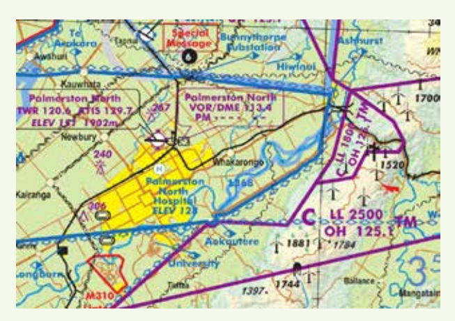
// The current VNCs have given way to the new VNCs (example below) which are less cluttered.

"The new VNCs are less cluttered. Obstacles lower than 150 feet above ground level, for instance, are no longer displayed and neither are minor roads. This has improved chart readability.