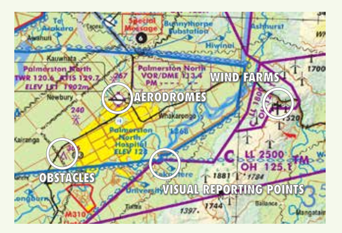
// Symbology in current VNC

They're a lot sharper and clearer than previous charts, and they feature enhanced symbols for obstacles, aerodromes, visual reporting points and danger areas.