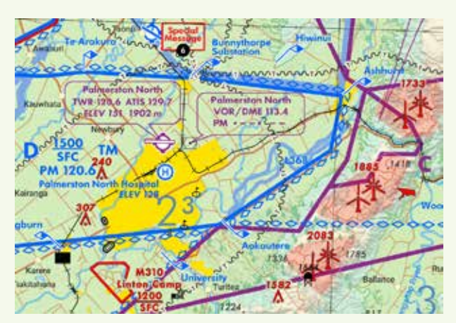
// New VNC

"In addition all chart elements have been reprioritised. For instance critical obstacles now take precedence over less important features. They're larger, clearer, and aren't hidden behind airspace lines."