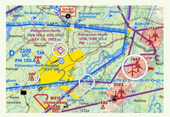
// Symbology in new VNC